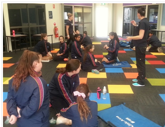
Year 7 and VET Sport and Rec students participate in First Aid activities

Monday kicked off with our Year 10s participating in an Alternative Games Excursion. Various workshops took place around Melbourne with students choosing between ultimate Frisbee lawn bowls, adventure running, dance and yoga, and rock climbing. Tuesday was our First Aid Responder Day with Vic Lifesaving taking all our Year 7s through a First Aid introductory course and all our VET Sport and Rec students completing their Level 2 in First Aid.