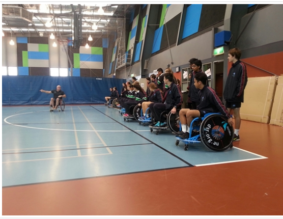
Year 9 students participate in a Wheelchair Basketball Workshop

Friday was another busy day with Year 8s completing their Orienteering program in the beautiful surroundings of Hawkstowe Park. Staff were also active across the week taking part in a series of activities to promote a healthy active workplace including healthy lunch competitions, morning boot camps and staff versus student games.