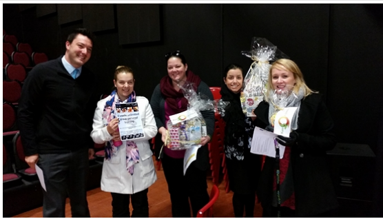
Staff prize winners

Friday was another busy day with Year 8s completing their Orienteering program in the beautiful surroundings of Hawkstowe Park. Staff were also active across the week taking part in a series of activities to promote a healthy active workplace including healthy lunch competitions, morning boot camps and staff versus student games.