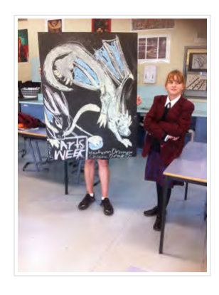
Year 10 students prepared Catching some fun while chalk 'edible art' drawing a 'dragon'