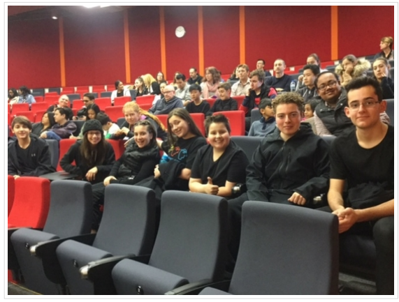
The TOM Engineering Mathematics Team