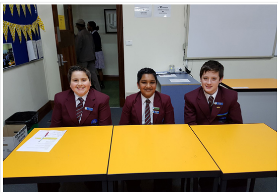
The winning D Grade debating team

Congratulations to all students and best of luck for future rounds.