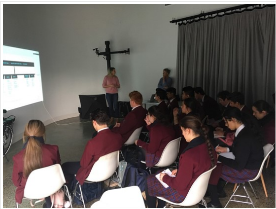
The GDJ Advertising workshop

The next place we all visited was Top Designs at the Melbourne Museum. This exhibition showcased the work of high-achieving VCE students of the previous year and it helped us to better understand how to layout our research and design folios. This excursion allowed our classes to be inspired to achieve higher standards with our work.