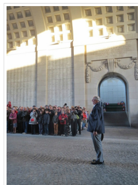
The Spirit of ANZAC students among the crowd at the Last Post Ceremony, Menin Gate, Belgium