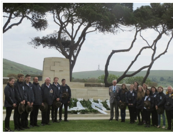
The Spirit of ANZAC students at East Mudros Military Cemetery, Lemnos, Greece