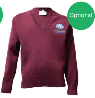
Pullover Maroon VCE