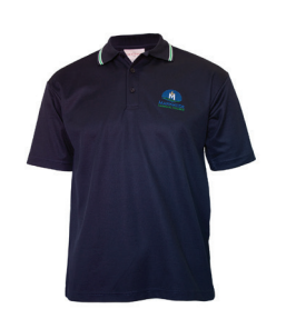
Sports Polo Top