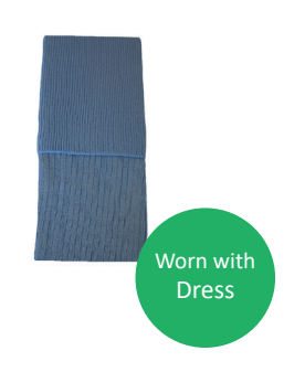
Anklet Sock Sky blue Sock Stripe Navy 2pkt 2 pkt