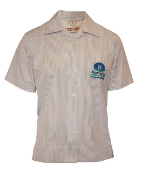
Blouse Short Sleeve