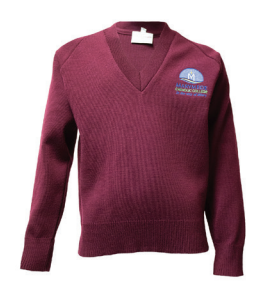
Pullover Maroon VCE