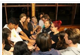
Successful relationships involve teamwork