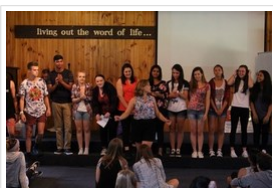
Right into the spirit of the Retreat