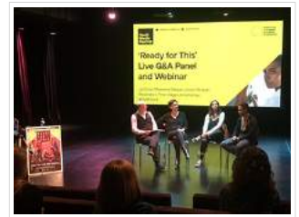
In the audience for the 'Ready For This' Q&A.