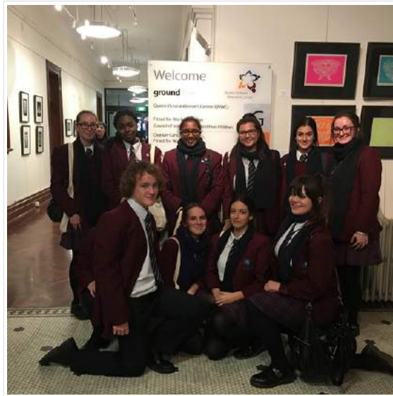
Year 11 students enjoying the excursion