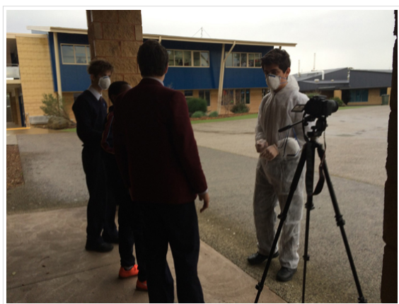
Year 9 Media students during production.

created for a real audience and a real client, and it addressed a real issue in our society.