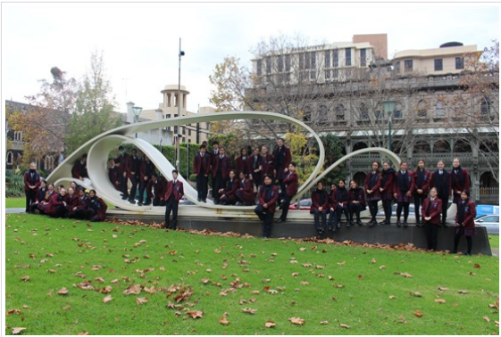
Studio Arts and Photography students explore Melbourne