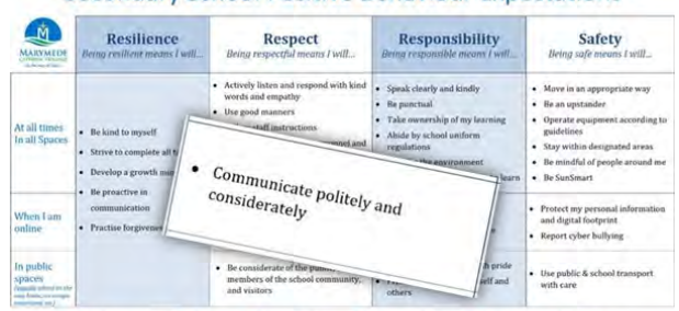
Primary School Positive Behaviour Expectations